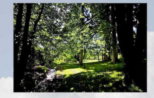
The retreat will include Eurythmy and Sculpture workshops which will take place in the mornings and late afternoons, leaving you time to unwind and the sumptuous surroundings with its stunning lakes and mountains.

Rydal Hall sits in a national convervation area of outstanding beauty in Cumbria. It has been chosen to create an all-around soul nourishing retreat to integrate both our inner and outer experiences.