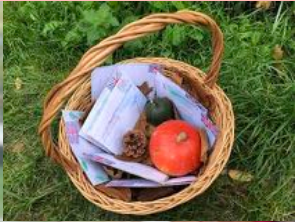
Class 4/5 receive letters from their pen pals in Gran Canaria.