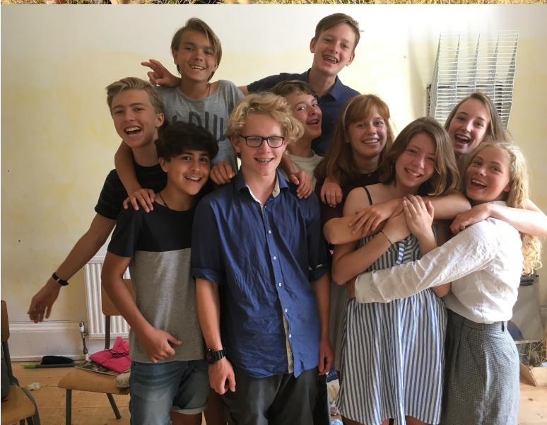
An actual human pyramid.