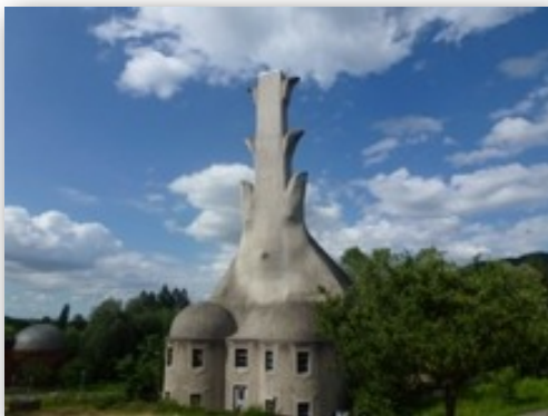
The Boiler House at the Goethanum