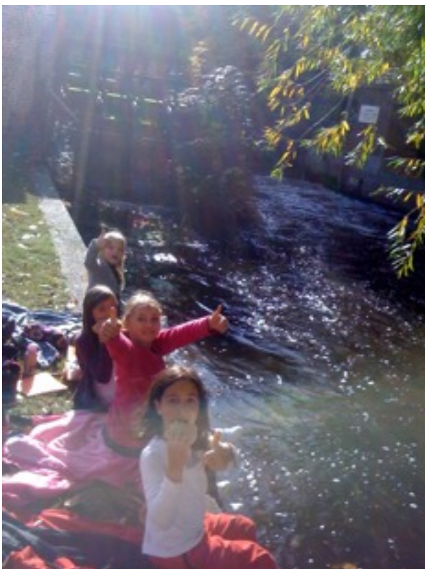
Class 3&4 on the Wandle and at Wandsworth Museum