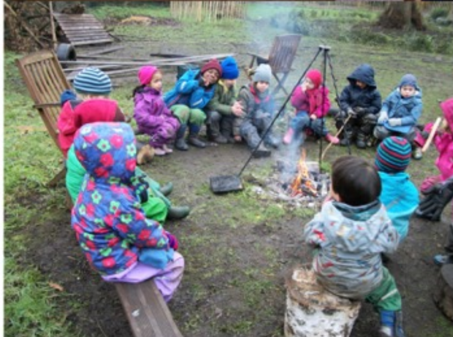
Trying to keep warm around the fire!