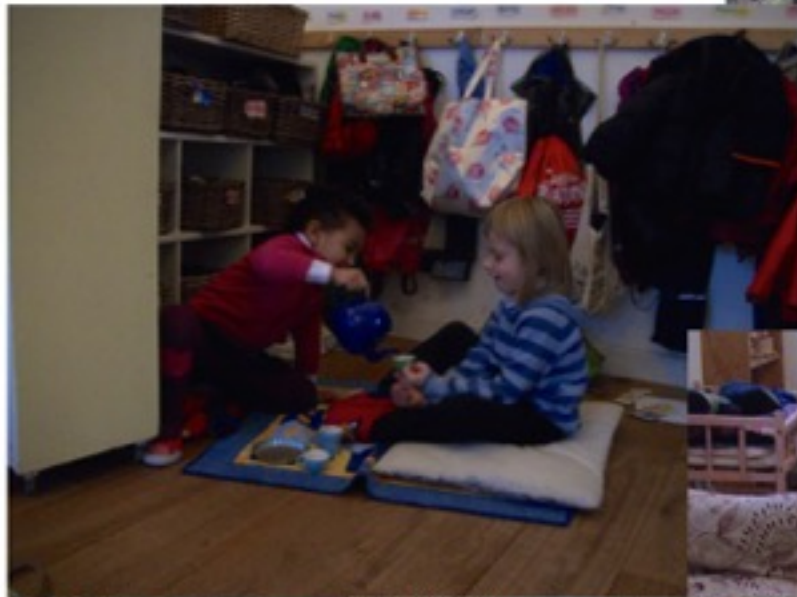
Would you like some tea?