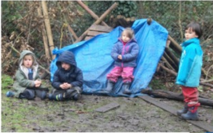
Waiting at the station for the train ...